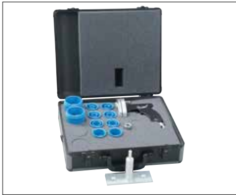
Part No. TH6-10-HL-10-2 (10 Nozzle Kit)