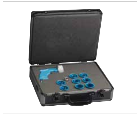
Part No. TH6-10-EL-8 (8 Nozzle Kit)